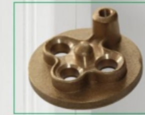
ET-WNE-18 FLANGE FOR HEATING ELEMENT Material:brass