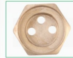
ET-WNE-14 FLANGE FOR HEATING ELEMENT Material:Brass