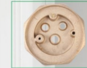
ET-WNE-27 FLANGE FOR HEATING ELEMENT. With rubber seal gasket