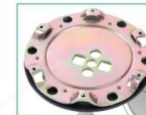
ET-WNE-34 FLANGE FOR HEATING ELEMENT. Round type.Made from rubber.