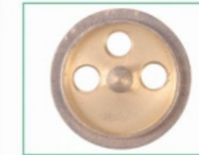
ET-WNE-19 FLANGE FOR HEATING ELEMENT. OD=11.7MM