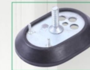
ET-WNE-36 FLANGE FOR HEATING ELEMENT. Material:Steel.1"1/4BSP threading